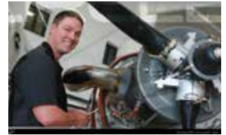
Maintenance technicians have over 30 years experience.