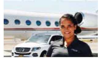
Customer Service Representative with one of Circle Air Group's Mercedes crew cars.