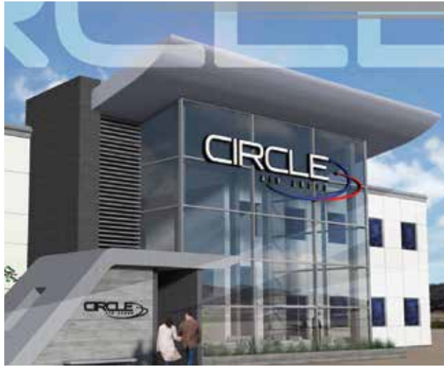
Circle Air Group - KSEE

"Circle Air is proud to be a member of the Air Elite Diamond Service Network of exceptional