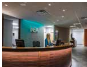
Northeast Air - KPWM